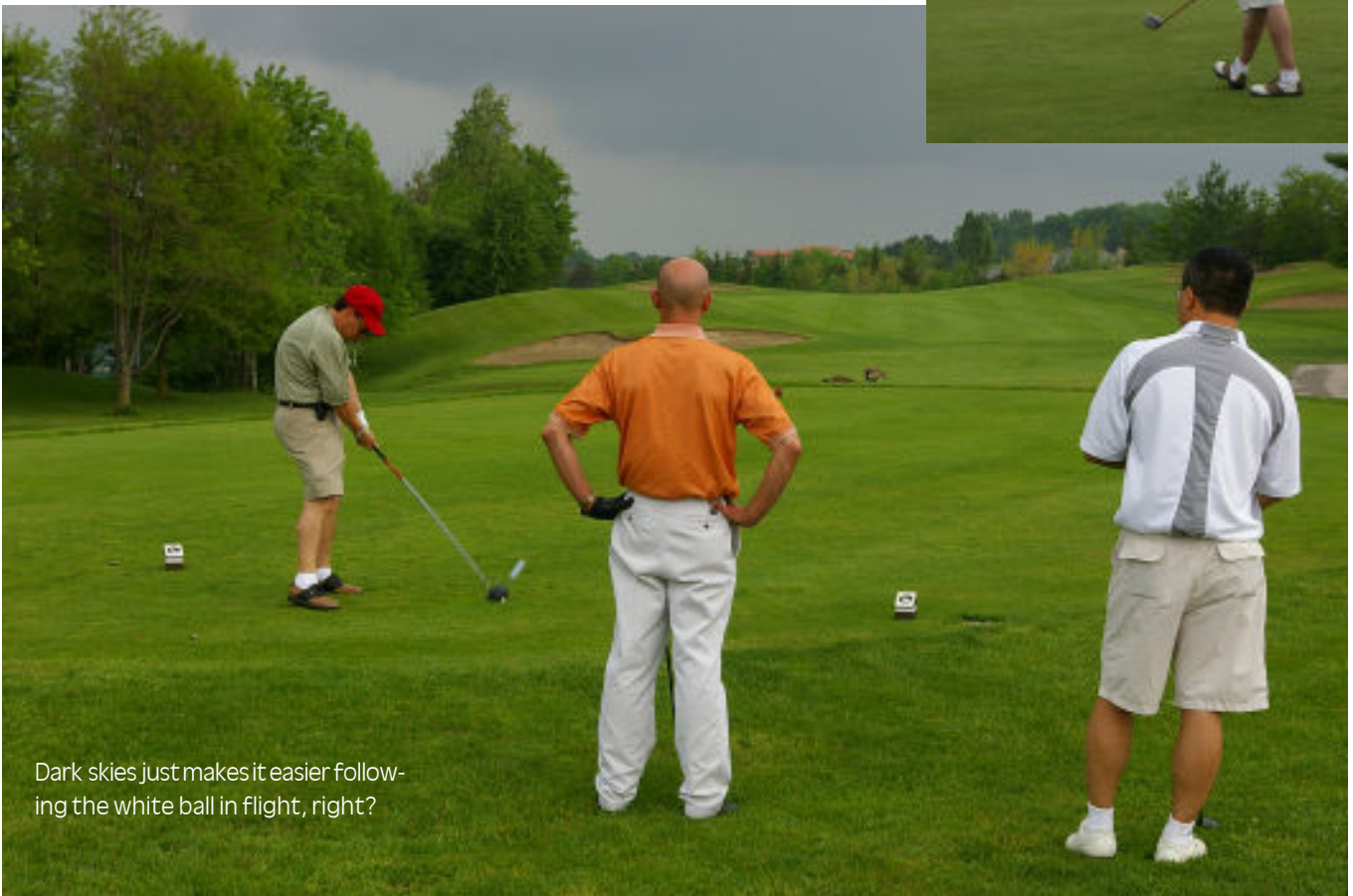
Dark skies just makes it easier following the white ball in flight, right?