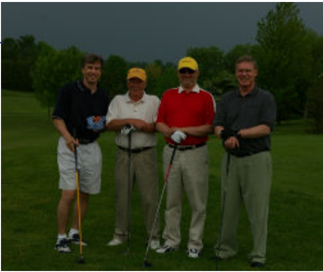
Too dark to play? Heck no, I can still see his hat!